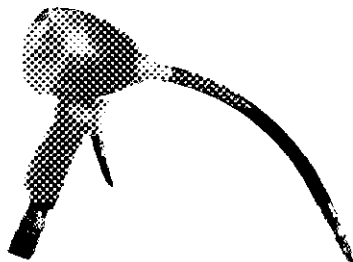
NO. 1515 METERING VALVE Pistol Grip Quart Meter For Motor Oil, And ATF. Totalizer, Swivel Connector 1/2" NPT. Flex Hose.