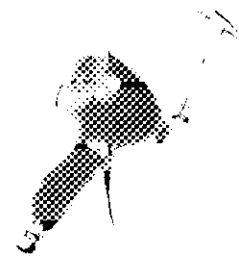
NO. 1503 METERING VALVE Pistol Grip Pint Meter For Gear Oil. Totalizer. Swivel Connector 1/2" NPT. Rigid Hammer Type Nozzle.