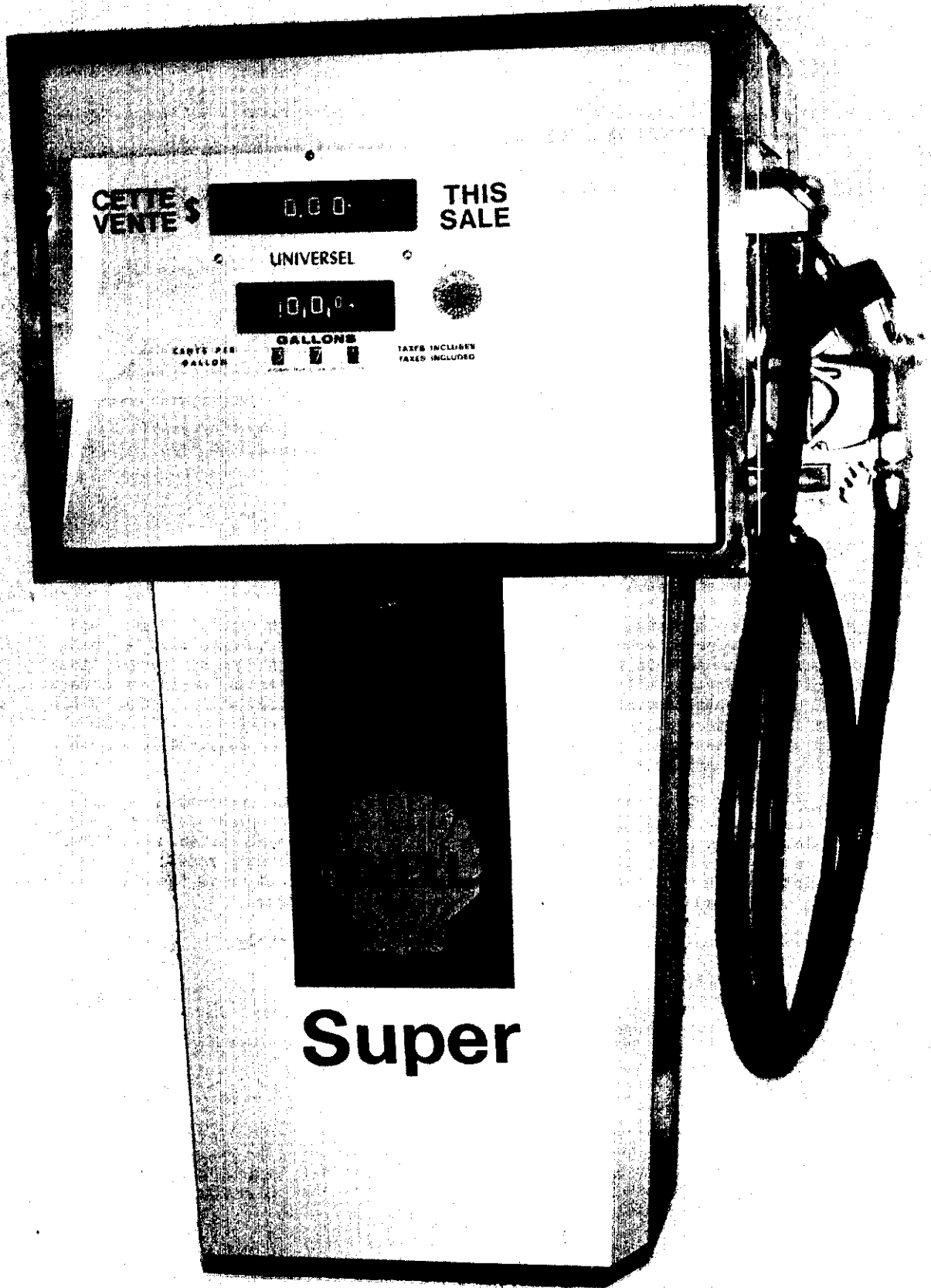
Cabinet for all T-Style models