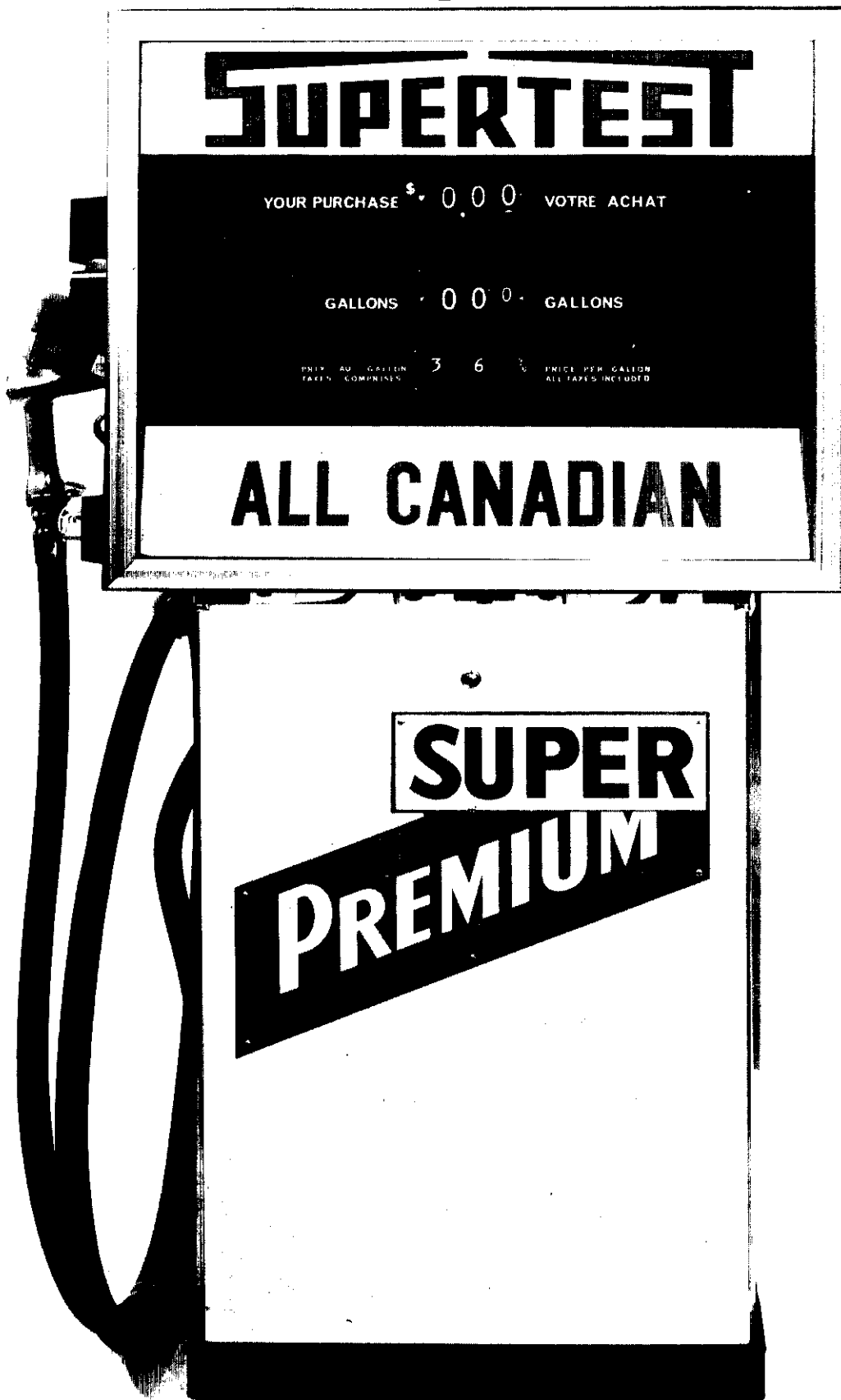
Model R 1006-1