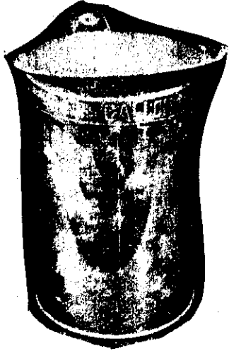
PEARL ENAMEL MEASURE