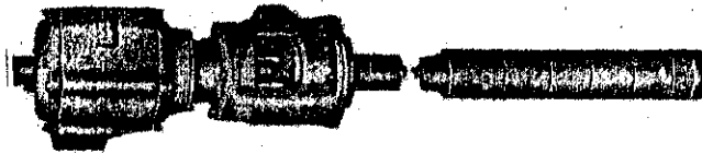
776 Series Pump Unit