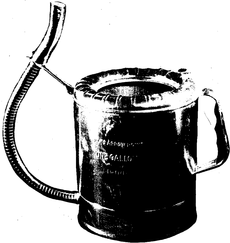
SWINGPOUT 1 GALLON MEASURE