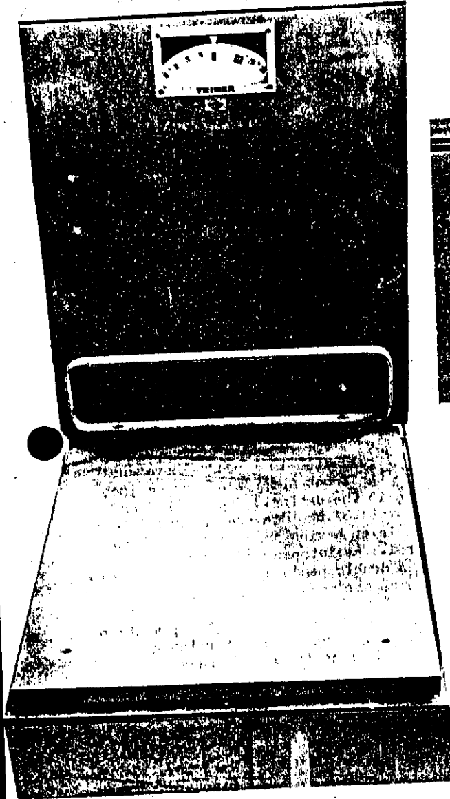
FRONT VIEW ENLARGED