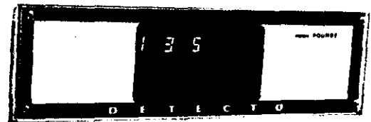
READOUT - MODEL 8225

CONDITIONS OF APPROVAL: Approval is granted under the Weights and Measures Act, S.C. 1970-71-72, Chapter 36 and the Weights and Measures Regulations (C. 1605) for use in Canada under the general conditions of the said Regulations and under any special conditions listed above.